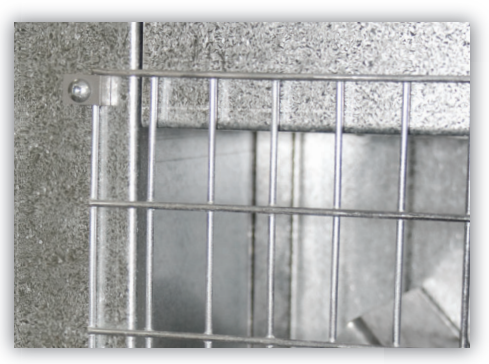
Removable 12 Gauge 1" x 2" wire mesh guards are hot dip galvanized after welding. The guard is attached to the housing with poly guard clips to reduce noise and vibration.