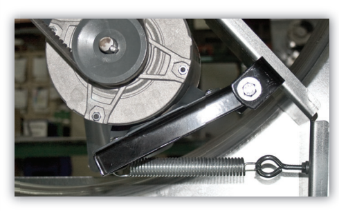
Belt drive models include a heavy duty spring belt tensioner to reduce bounce at startup and provide uniform loading to increase the life of the belt and maintain high efficiency.